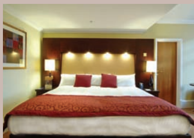
Double deluxe room

Bedrooms can be booked online please go to hilton.co.uk/nottingham/christmasparties2009